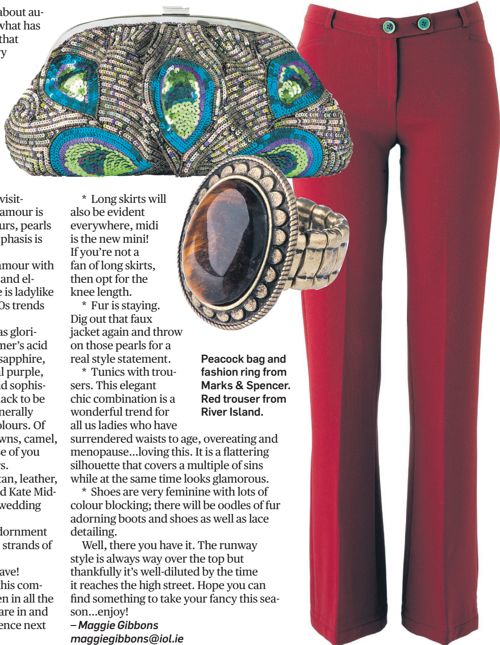
Peacock bag and fashion ring from Marks & Spencer. Red trouser from River Island.