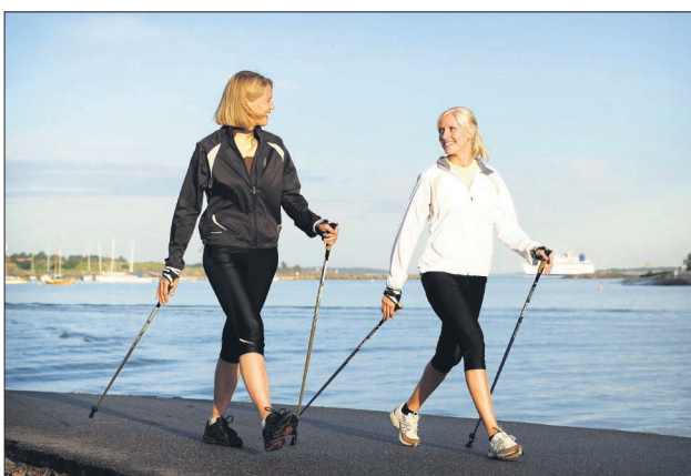
Nordic walking is a great way to exercise your upper and lower body together at the same time.

With a little bit of technique practice, you'll find that even though your heart, lungs and body are working harder, Nordic Walking can feel easier and less tiring than normal walking. You burn between 20 to 46 per cent more calories than in normal walking and you reduce neck, back and shoulder pain and increase muscle activity by up to 90 per cent. For further information or to book a place contact (087) 165 1645.