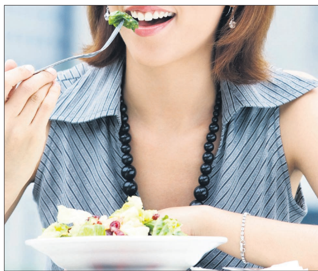
After gastric band hypnotism, participants feel that their stomachs are smaller, which leads to eating smaller meals.

"The gastric hypnotic band procedure is a new thing in Ireland. People here who